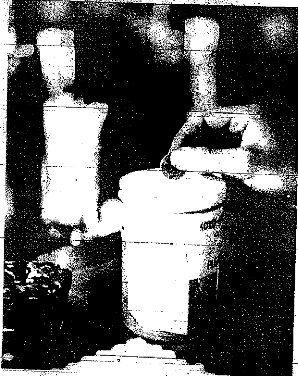
PENNY FOR YOUR THOUGHTS (right) How about a quarter for KOTO. Donations and public input help run Telluride's radio network, the smallest in the entire US.