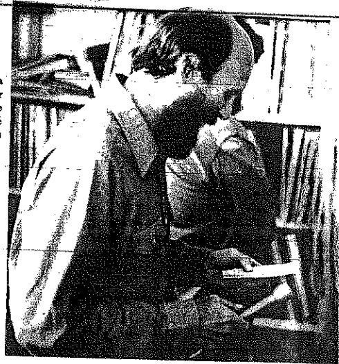
IT SPEAKS FOR ITSELF (below) A lot of booze flowed and a lot of music rolled through reception chambers at the Floradora.