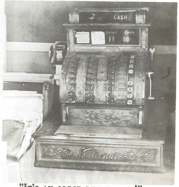
"IT'S AN OLDIE BUT GOODIE!"

"Western wear has set the style. It's going all over the country. We have had many changes through the years, like the horse collars. We don't have much demand for horse collars anymore, other than for the cutter racers. We used to sell boots for fifteen dollars, and now a similar boot sells for sixty dollars. I think the first Wrangler jeans were three ninety-eight, and now work shirts are twelve dollars and jeans are from thirteen dollars up.