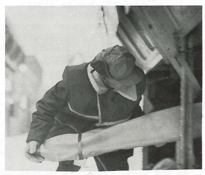
"I just worked where it was to be done."

"This Dakota fire guy took thirty people in an' tried to fight the fire from the inside," he scoffed. "Boy, he got caught. Got shipped right back to Dakota. The forest ranger wouldn't even let him stay with us when he found out what he was doin'. Why everybody knows you can't fight a fire from the inside out. You gotta stav out an' bring it in. "Oh yeah," he reflects, "I've seen a lot of ground.