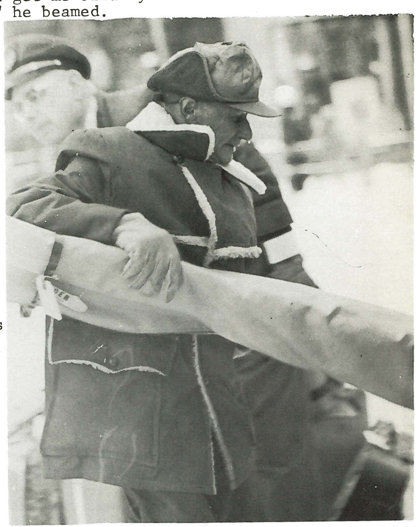
"I didn't care, I just liked to live."