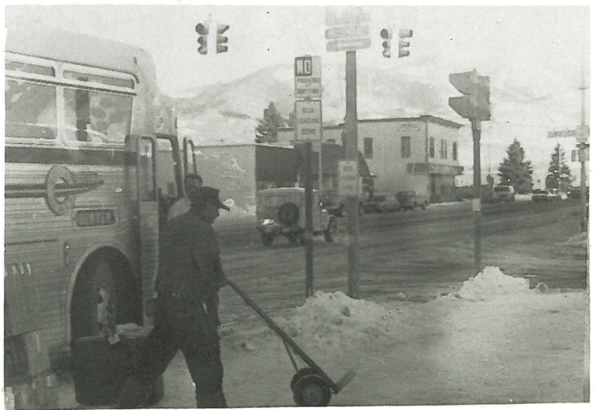
"I just love the mountains."

"As for church. Well, I went to one of them Catholic Churches til '45, but I ain't been to one since."