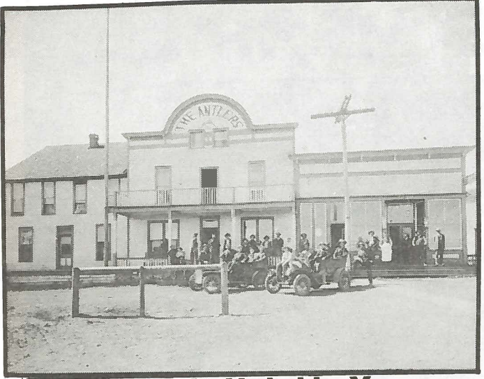
The Antler's Hotel in Yampa

told. It was stormy, and the stagecoach turned over outside Steamboat along the Yampa River near Big Foot Smith's ranch that was next to the suburb, as we called it, of Brooklyn.