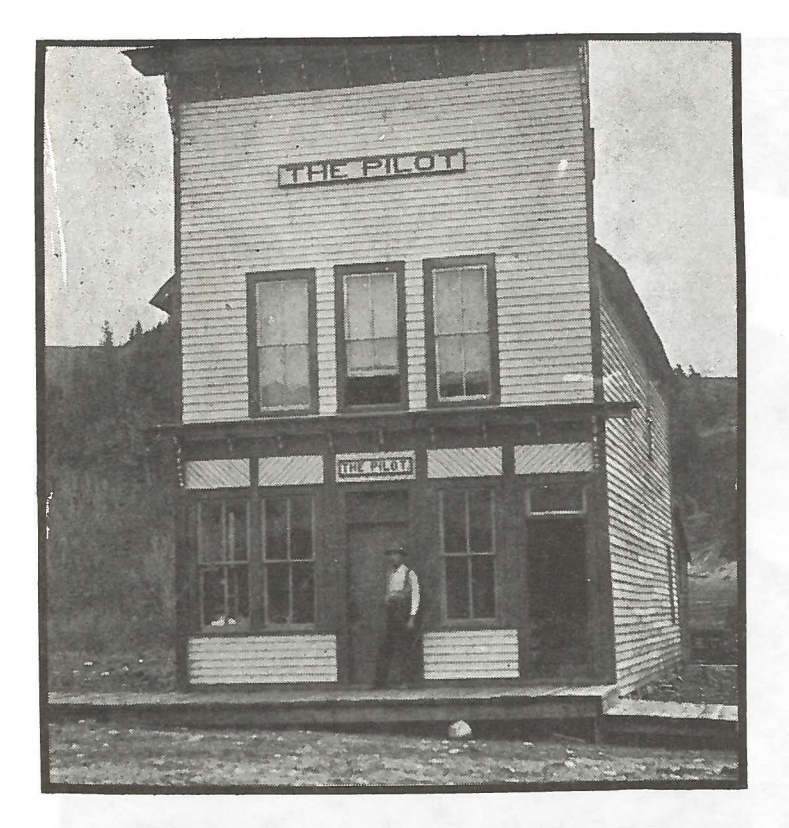
The Pilot before it burned down.

had three years of high school and missed many basic subjects, such as chemistry and mathematics. I did graduate in 1923, and I went to work at the General Electric Company. I worked there until my health failed in 1928, and I came back to Colorado.