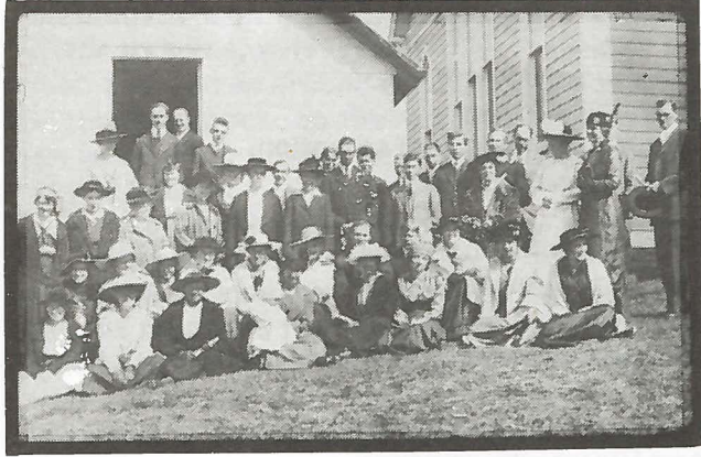
The church has seen many changes and fads.

We decided we would work until we used up the material and then take some time off until we could raise some more money. Only the Lord