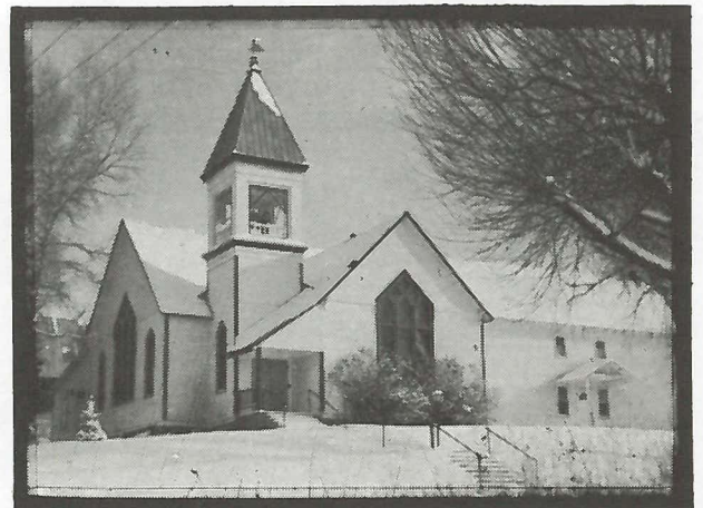
The church as it stands now.

"Then in 1916, while I was going to high school, I was more or less forced by my folks to take the janitor's job at the church for $8.00 per month, for pocket money. As money had a great value in those days I took the job, to date girls I needed at least 25 to 50 cents to buy them an ice cream soda. I couldn't enjoy skiing anymore on Saturday because of my job. Then one Saturday, lo and behold, I found a big can of ice cream, 3/4 full in a Sunday School room. I immediately thought they had decided to leave me some ice cream for the harsh treatment I had endured. I hot-footed it out and got all the kids I could find,