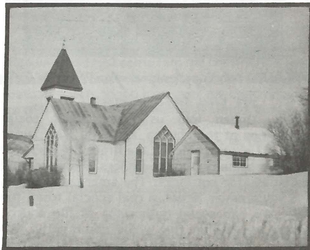
The church as it was before.